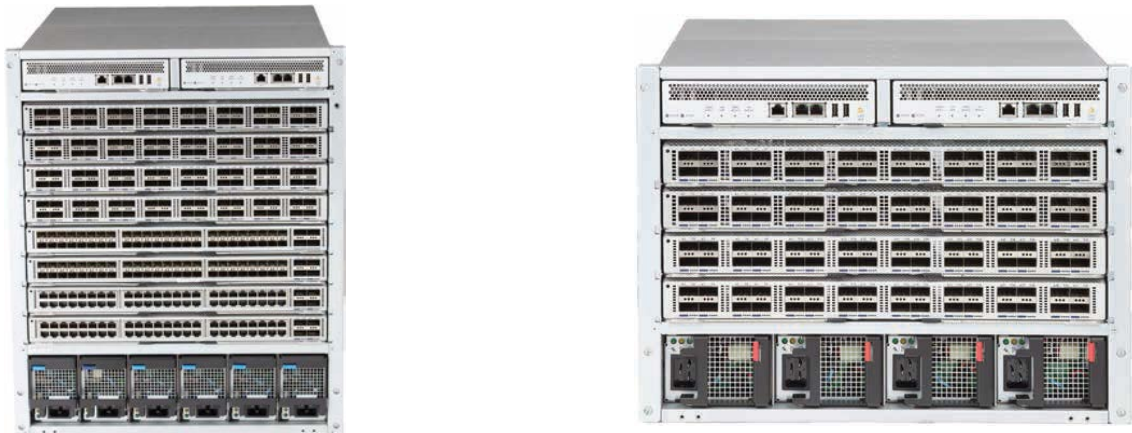
Arista 7300X Series Modular Data Center Switches

With reversible front-to-rear or rear-to-front airflow, redundant and hot swappable supervisor, power, fabric and cooling modules the system is purpose built for data centers. The 7300 Series is energy efficient with typical power consumption of under 3 watts per 10GbE port for a fully loaded chassis. All of these attributes make the Arista 7300 Series an ideal platform for building reliable, low latency, resilient and scalable data center networks. Combined with Arista EOS the 7300 Series delivers advanced features for big data, cloud, virtualized and traditional designs.