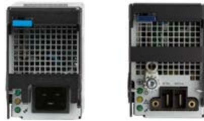
Arista 7300X Series Power Supplies

The AC power supplies are platinum climate saver rated and have an efficiency of over 93% with single stage conversion to the internal DC voltage. The DC power supplies require inputs at -48V DC to deliver up to 2700W. The 7300 Series uses multiple small power supplies which allows for incremental provisioning and smaller input circuits. Variable power supply fan speeds ensure power supply efficiency is optimized and reduces noise in data center environments.