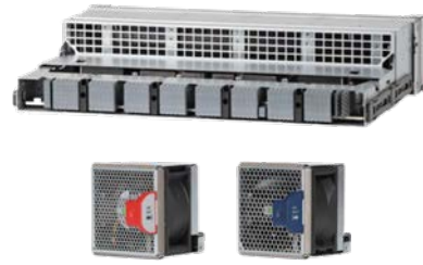
Arista 7300X Series Fabric/Fan and Fans

each line card module. Each line card module connects to the fabric with multiple links and flows are spread across these paths to efficiently utilize the available fabric capacity. The fabric modules are always active-active, providing high availability and can be hot-swapped with graceful performance degradation. The fabric modules for the three chassis are different based on the size of the chassis and each accommodate a set of individual hot-swap fan modules. The fan modules support forward and reverse airflow and provide redundant cooling. Each fan module can be independently replaced without any impact of the system.