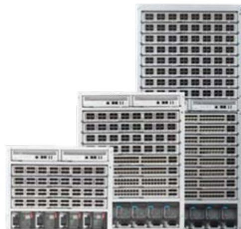
Arista 7300X Series Chassis

The midplane is completely passive and provides control plane connectivity to each of the fabric and line card modules. The system is optimized for data center deployments with front-to-rear and rear to front airflow options